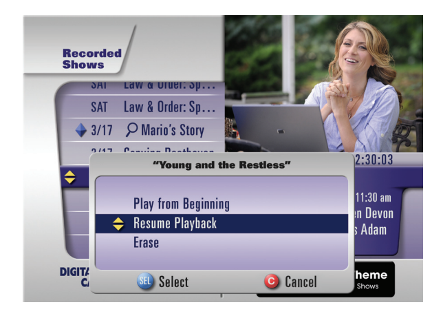
Program Info on networked set-top boxes Select Record Options, Play, Play from beginning, Erase or Keep Longer

You can stop playback of a recorded program in one room on the network, and resume playback in another room. If four users are playing the same recorded program on four different set-top boxes, and each playback is stopped at different times before the end of the recording, playback will resume for all users from the most recent stopped recording.