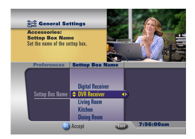
Accessories, Set-top Box Name Options on Networked Set-top Boxes. Choose from a list of available names.