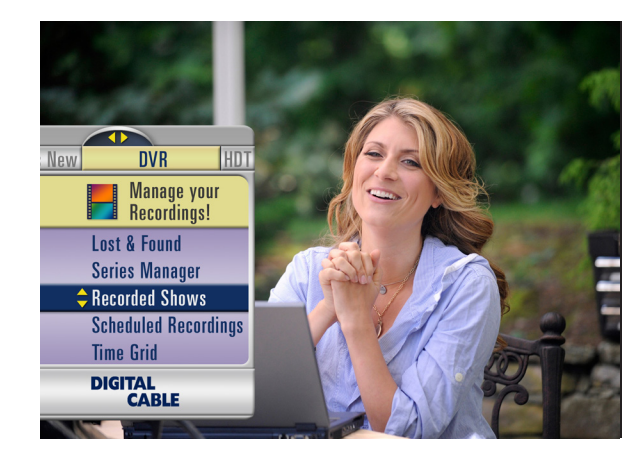
Quick Menu with DVR on networked set-top boxes The DVR category provides access to Recorded Shows

To enjoy recordings stored on your primary DVR from set-top boxes in the home simply press LIST (or MY DVR) to access your Recorded Shows. You can also access them from the Guide for example, select DVR from the Quick Menu (press MENU once to access Quick Menu), or select Recorded Shows from the find shows options (press GUIDE twice).