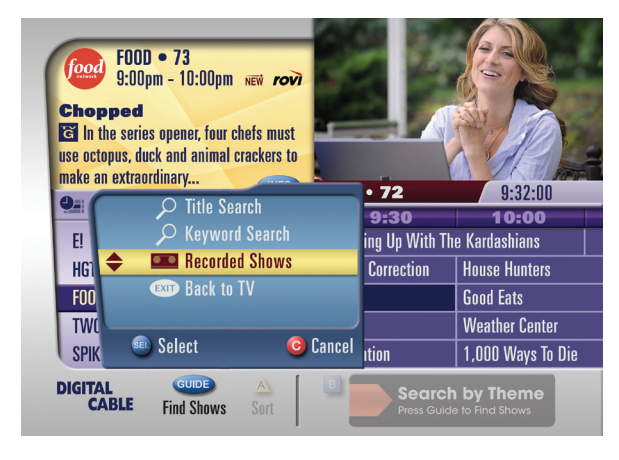
Find Shows on networked set-top boxes Recorded Shows goes to list of DVR recordings