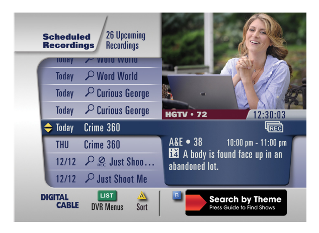
Scheduled Recordings on networked set-top boxes. Access DVR Menus or sort to Group Titles.

Select Scheduled Recordings from the DVR Menu to view a list of future recordings. Highlight a title and information appears in the lower right corner. Press SELECT/OK on a title to modify recording options or cancel a scheduled recording. Press INFO to view program info. Press A to Sort to Group Titles.