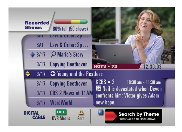
Recorded Shows on your primary DVR Access DVR Menus, sort to Group Titles or view DVR Network Information

Enjoy all the benefits of DVR! The primary DVR on your home network has full DVR functionality to play, schedule and delete recordings and pause live TV. Your primary DVR can record two programs simultaneously – even HD shows – while up to three secondary set-top boxes on the network enable you to play, schedule, delete and manage your DVR recordings. From the Recorded Shows list, an icon indiciates those recordings that are being viewed in another room. Recordings cannot be deleted until playback has ended. You can even play the same recording on up to four set-top boxes simultaneously.