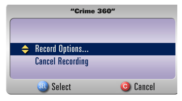
Scheduled Recordings on networked set-top boxes Select Record Options or Cancel Recording.