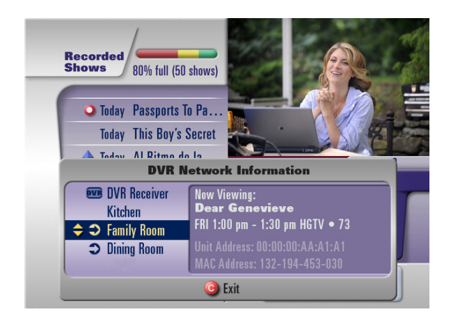
DVR Network Information on your primary DVR View networked set-top boxes in the home