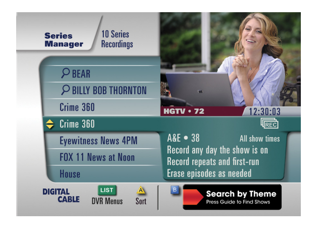
Series Manager on networked set-top boxes. Access DVR Menus or sort to Group Titles.

Select Series Manager from the DVR Menu to view a list of scheduled series recordings and keyword series recordings. Keyword series appear in ALL CAPS and has a search icon indicator. Press SELECT/OK to modify series options.