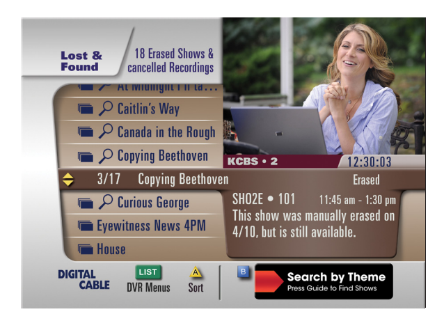
Lost & Found on networked set-top boxes . Access DVR Menus and sort to GroupTitles

Select Lost & Found from the DVR Menu to view a list of missed and previously deleted recordings. When you highlight a title, instant info appears in the lower right including a short reason why the program was missed or when it was deleted. Press A to group titles and review summary of erased and missed recordings by folder. From your primary DVR, you may also recover some deleted recordings if available.