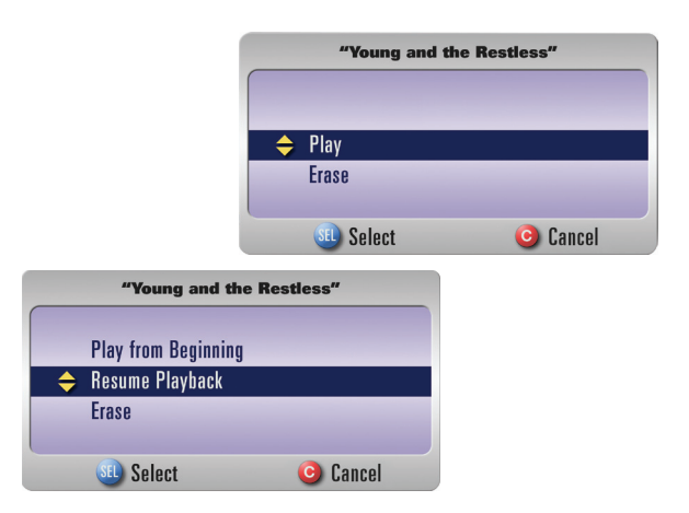
Recorded Shows Options on your primary DVR Options vary if the recording has been viewed