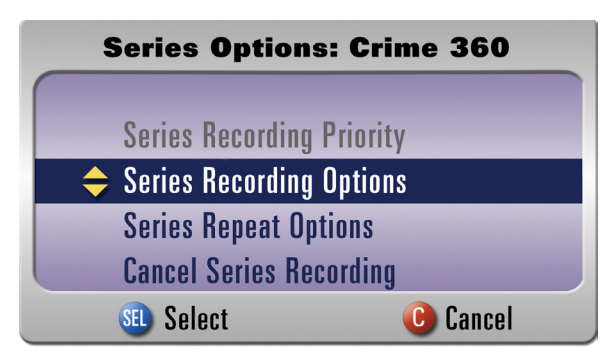
Scheduled Recordings on networked set-top boxes

Note: The grey shading of Series Recording Priority indicates the option is not available on networked set-top boxes.