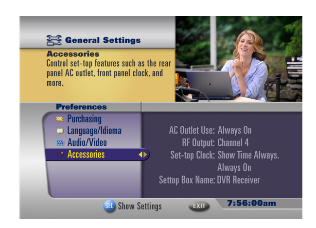
General Settings, Accessories on networked set-top boxes. Arrow right to acces options.

From a networked set-top box you assign a name to denote the location in the home. To assign a name to each of the networked set-top boxes in your home use General Settings menu (press Settings or Menu twice), select Accessories then Settop Box Name and select from the list, for example Bedroom, Family Room, Office and more.