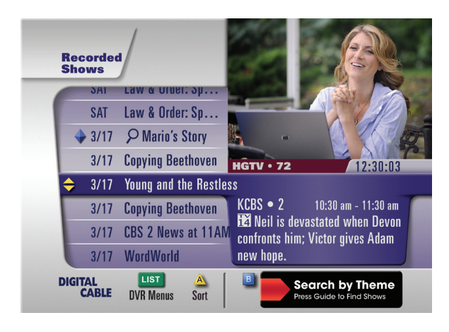
Recorded Shows on networked set-top boxes Sort by Date, or Group Titles

Press LIST (or MY DVR) to access the Recorded Shows list, choose a program and press OK for program information. Follow the on-screen prompts to play or resume – or even restart a program from the beginning. Pause, fast-forward, rewind and instant replay to control your recorded show. Parental Controls settings are unique to each set-top box on the network. Remember, you can only control live TV on the primary DVR.