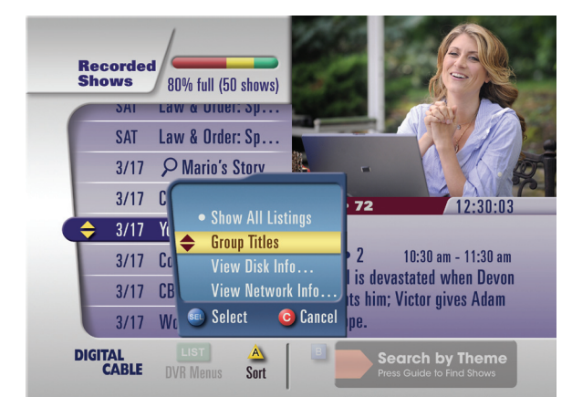
Recorded Shows on your primary DVR Access sort to Group Titles, view Disk Information and view Network Information

From The Recorded Shows list, press A to view DVR network information for a list of networked set-top boxes in the home and the recordings being viewed. An icon will appear if a recording is being viewed within the home network.